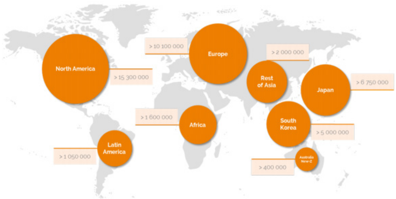
Active Crypto Traders Across The Globe

The distribution of traders by the geographical location is shown in the image below: